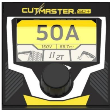
Simple and intuitive TFT LCD panel